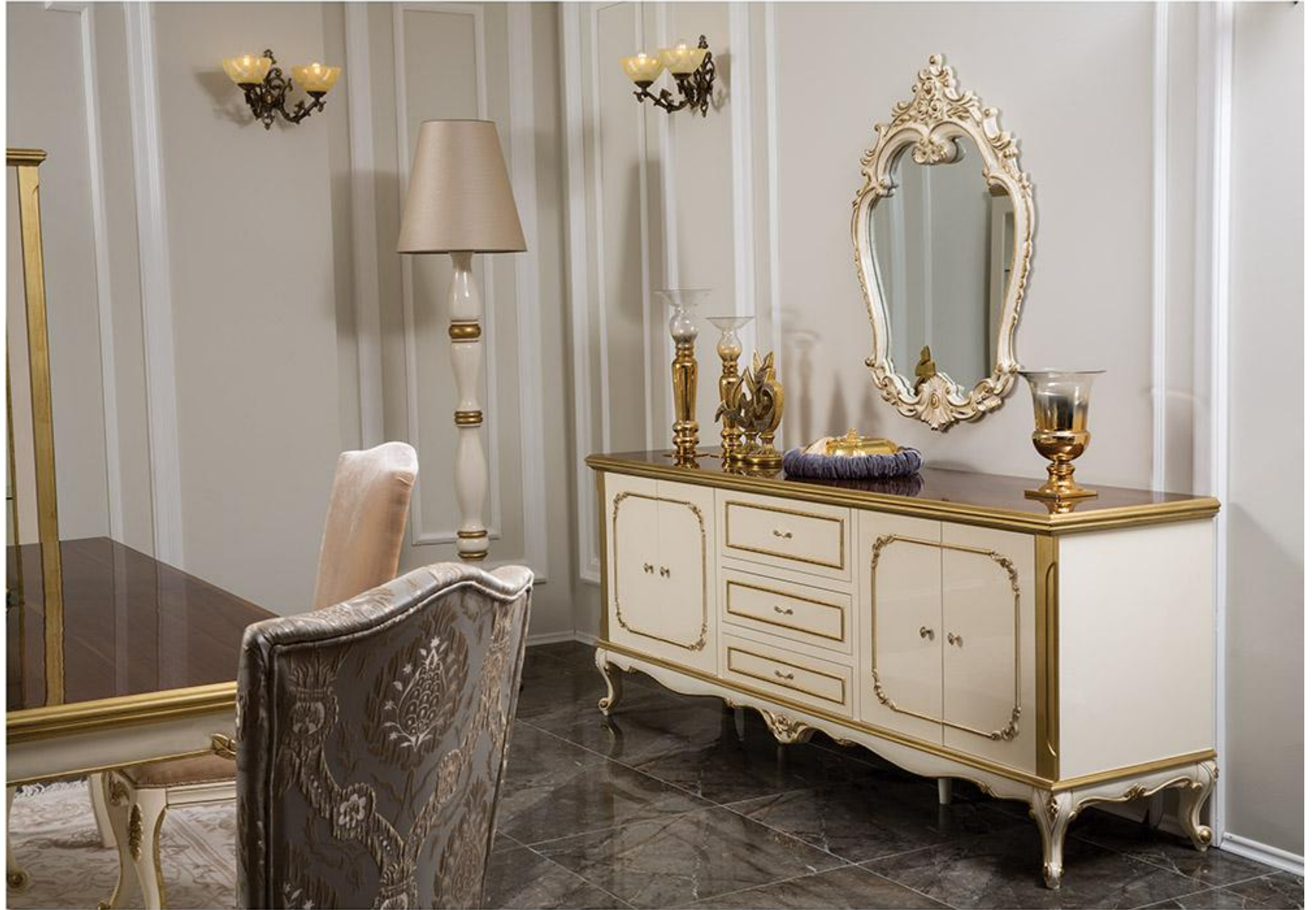
Cabinet 107x47x185 Console 216x55x87 Mirror 79x51x07 Dining Table 190x90x80 Chair 1 60x53x106 Chair 2 56x53x106