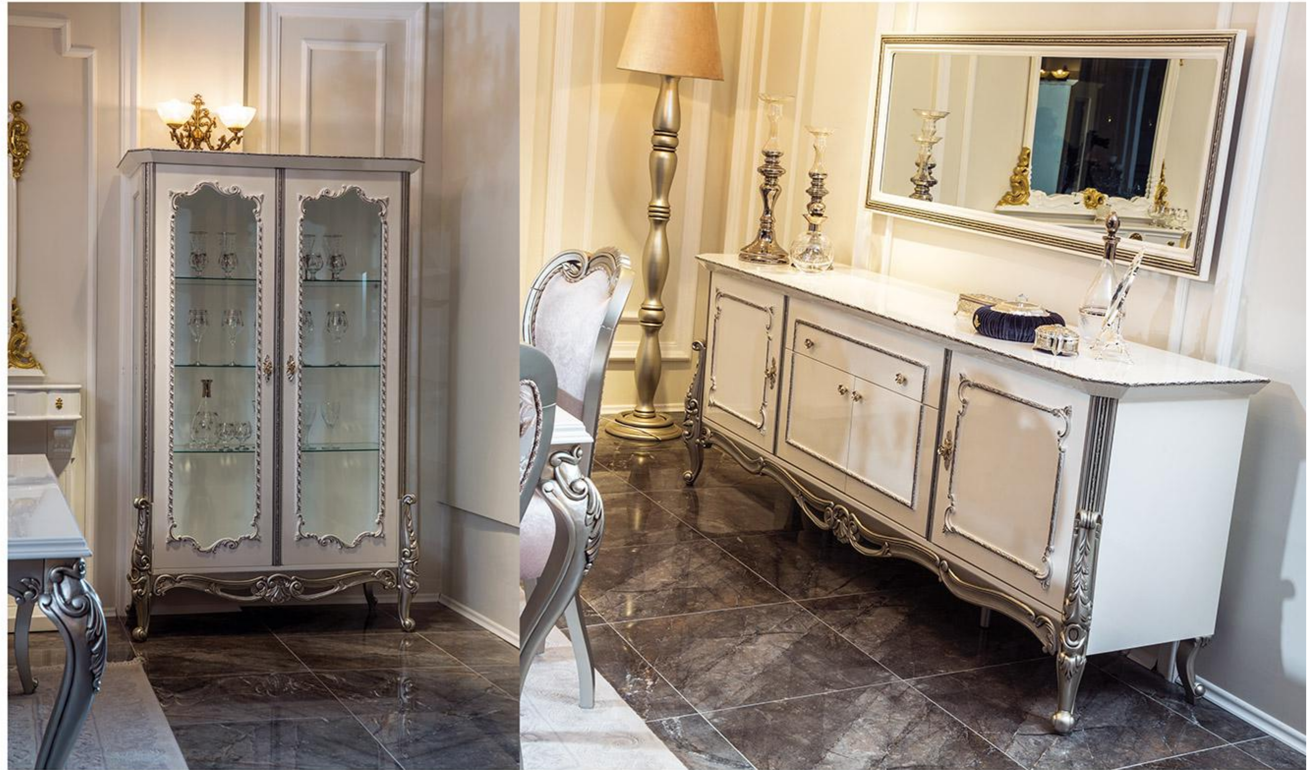
Cabinet 125x55x195 Console 231x55x89 Mirror 169x5x64 Dining Table 197x97x80 Chair 1 60x52x107 Chair 2 52x52x107