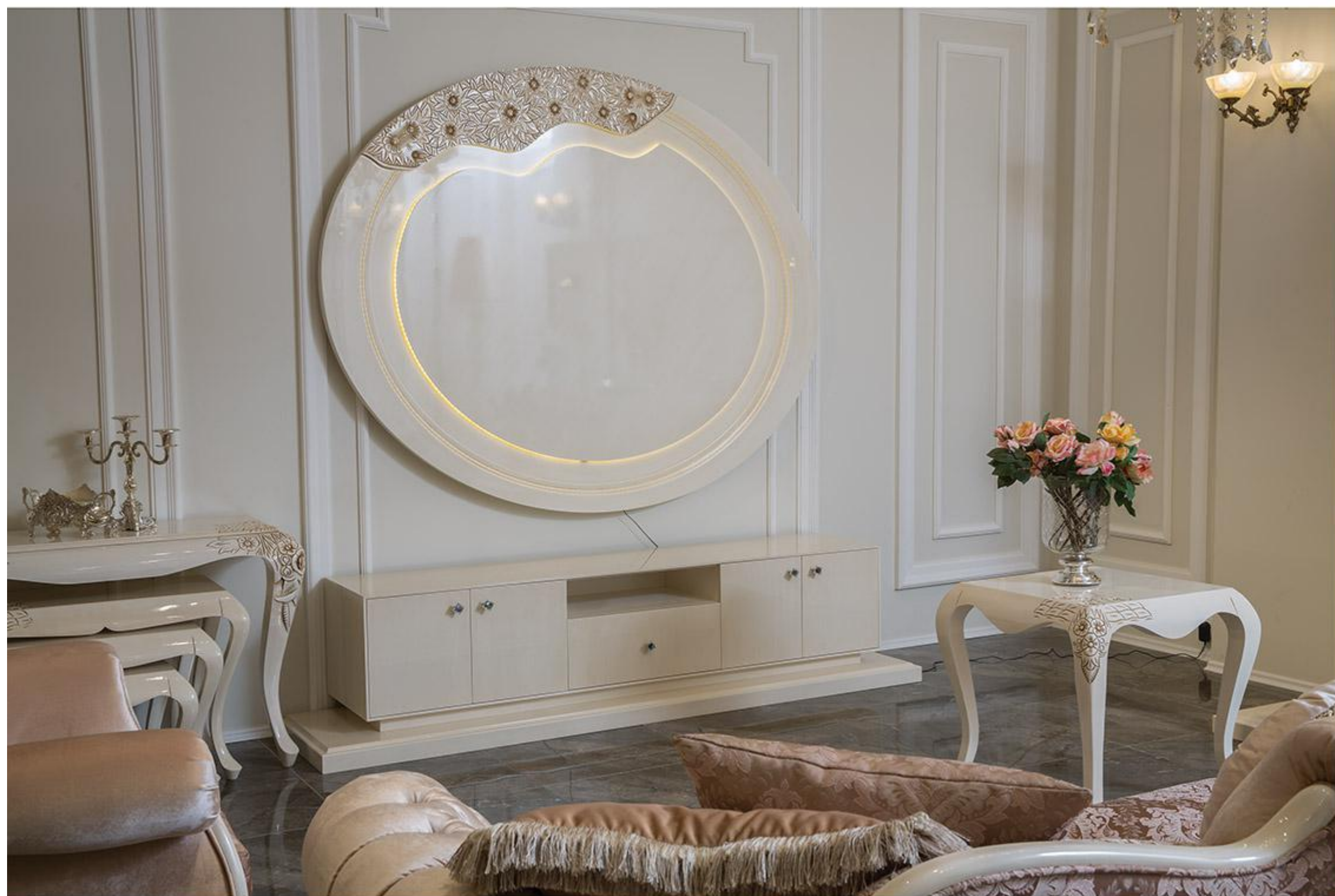
Golden Horn Tv Unit 250x52x50