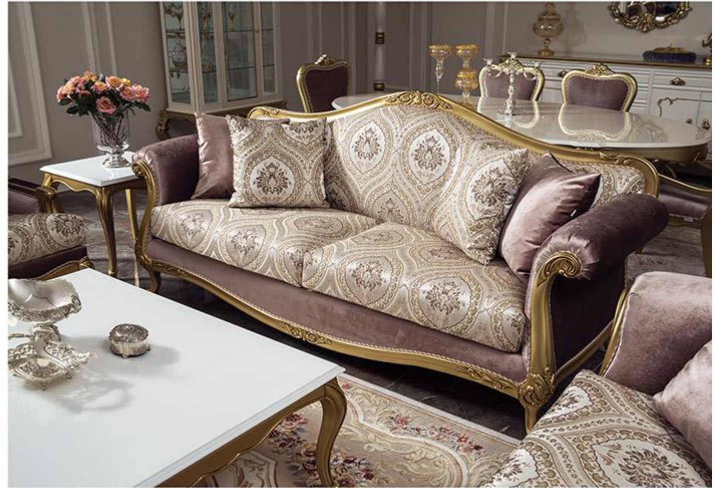
1 Seater 228x22x21 2 Seater 183x23x21 Armchair 8x74x66 Table 125x90x14 Coffee Table 55x55x54