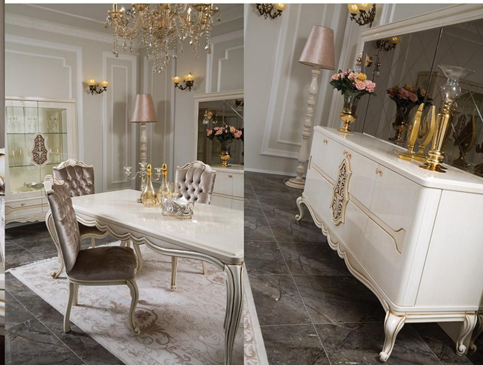
Cabinet 118x49x186 Console 210x50x95 Mirror 310x5x193 Dining Table 193x95x78 Chair 1 62x55x110 Chair 2 56x55x110