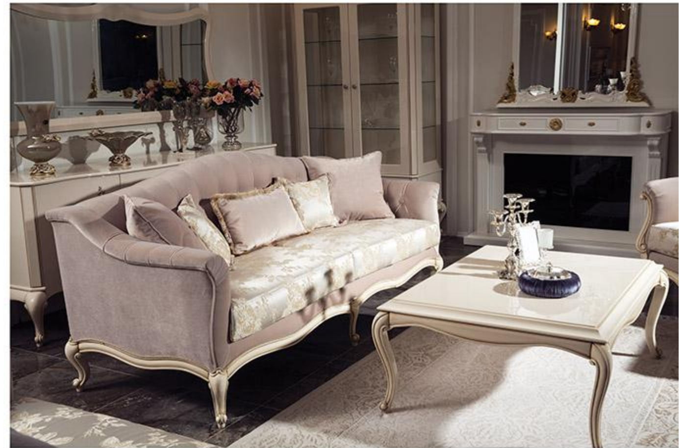
3 Seater 210x83x92 2 Seater 193x83x92 Armchair 80x70x111 Table 110x85x48 Coffee Table 51x51x55