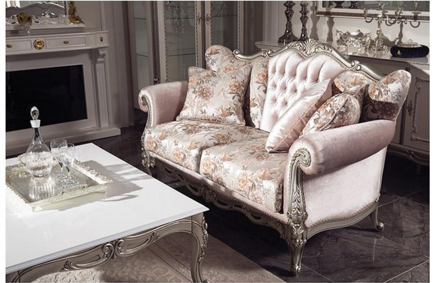
Le viera Silver