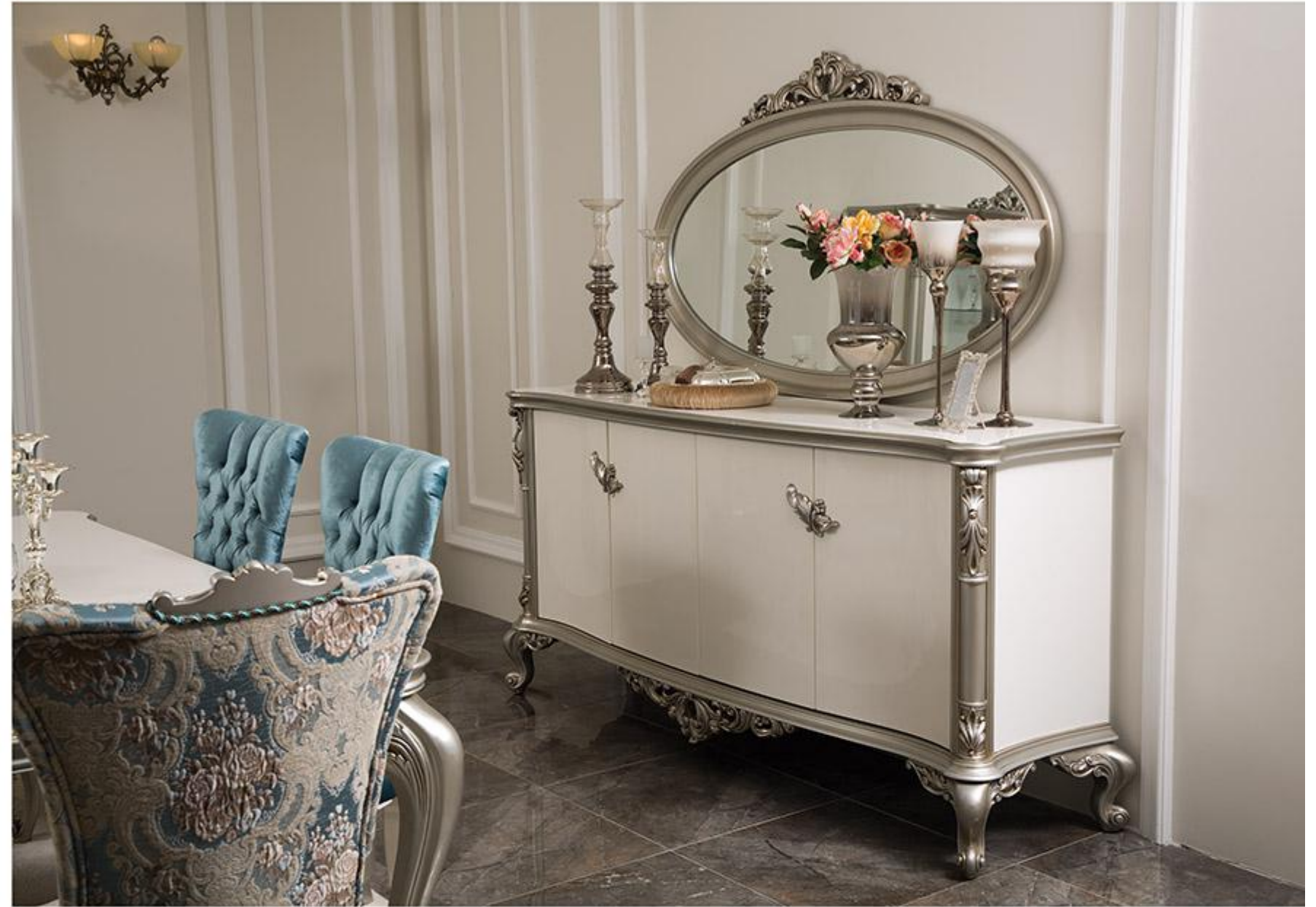
Cabinet 124x54x198 Console 208x56x102 Mirror 167x51x100 Dining Table 210x108x80 Chair 1 65x56x107 Chair 2 55x56x102