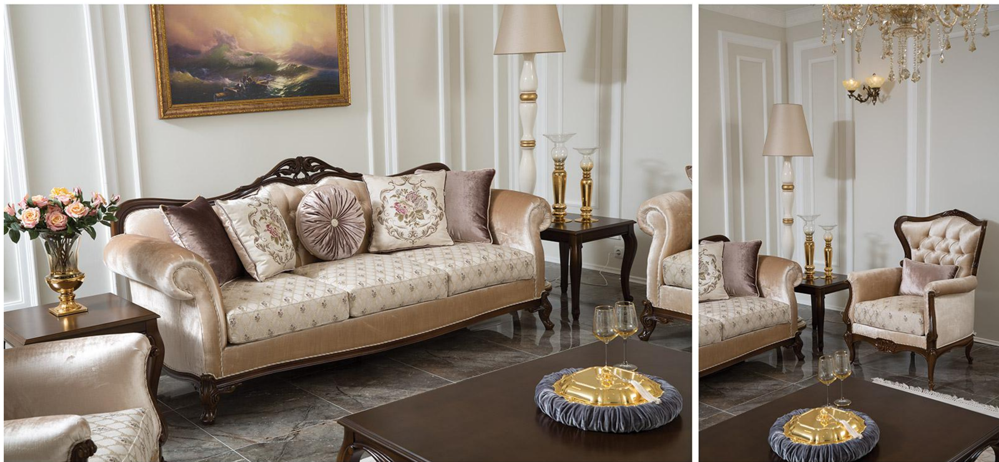
3 Seater 242x84x104 2 Seater 208x84x104 Armchair 82x70x116 Table 128x89x46 Coffee Table 55x55x55