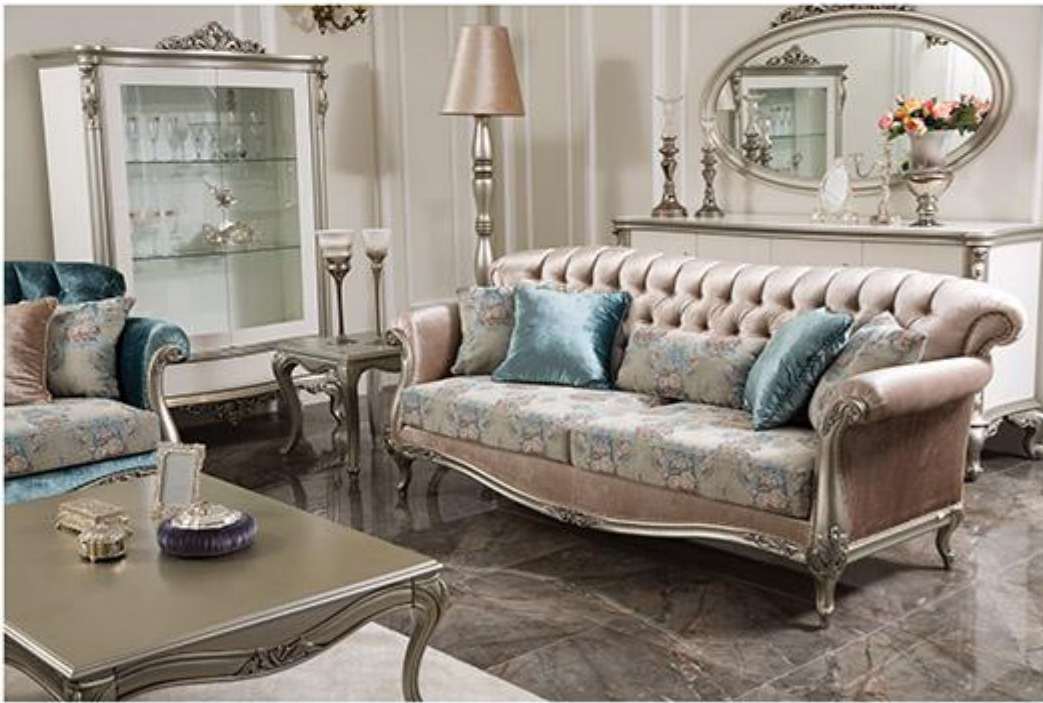
3 Seater 230x80x92 2 Seater 184x80x92 Armchair 94x77x111 Table 126x90x46 Coffee Table 55x55x54