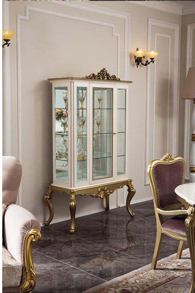
Cabinet 107x45x176 Console 210x56x96 Mirror 79x5x107 Dining Table 130x128x78 Chair 157x50x101 Chair 2 50x50x101