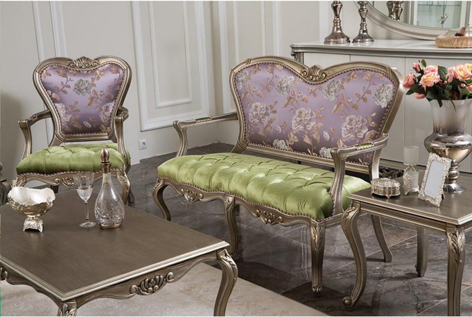
2 Seater 140x70x116 Armchair 70x70x116 Table 125x70x41 Coffee Table 55x55x55